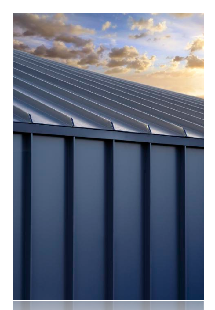
Snap-Line 45® x 345mm Basalt®

*Softer metals such as Zinc and Copper will require continuous substrate backing under the sheet.