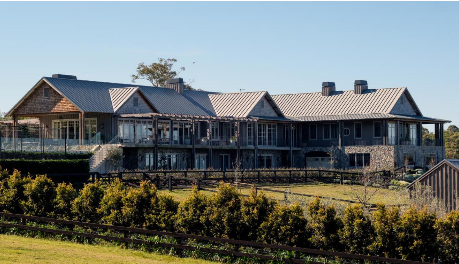
Snap-Line 45® x 445 Windspray®