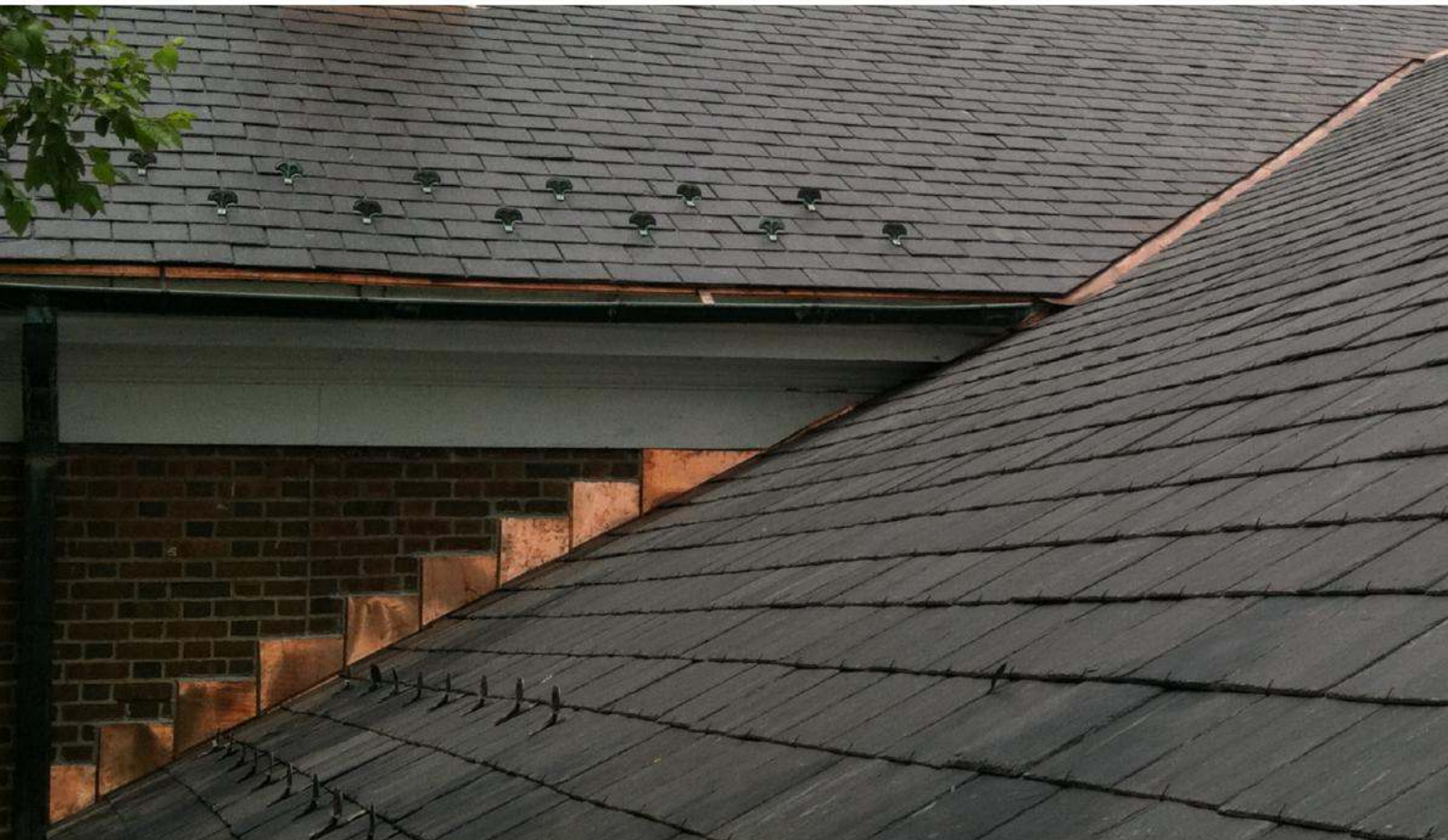
Architectural Slate Roofing