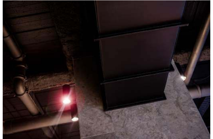
Standing Seam VMZinc™ Anthra